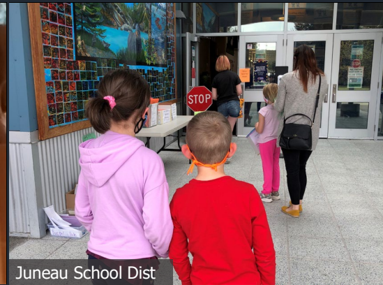
Juneau School Dist