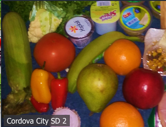
Cordova City SD 2