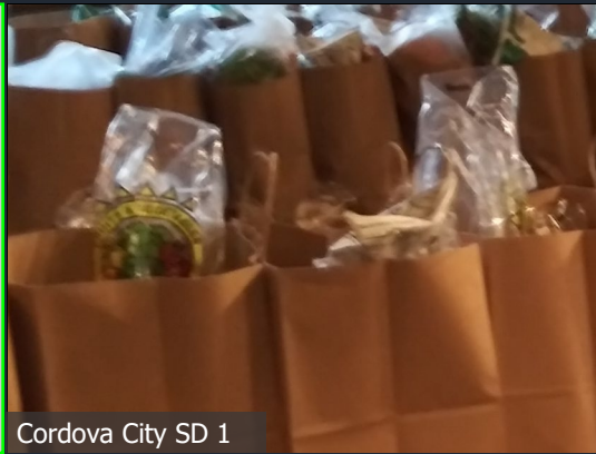
Cordova City SD 1