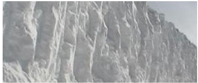
Capitol building photo taken March 2021, don't mind that the sun is coming from the northeast, I didn't have time to photoshop it better.