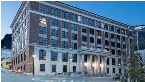
FILE PHOTO: Capitol Building, photo taken on an unusually sunny day in Juneau